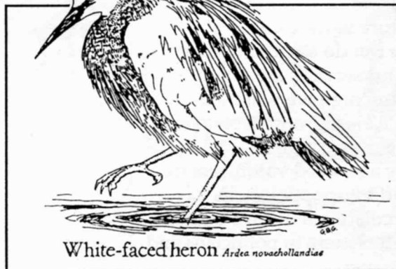
A Wolli Birdo

There are alternatives! Think about it and be prepared to act.