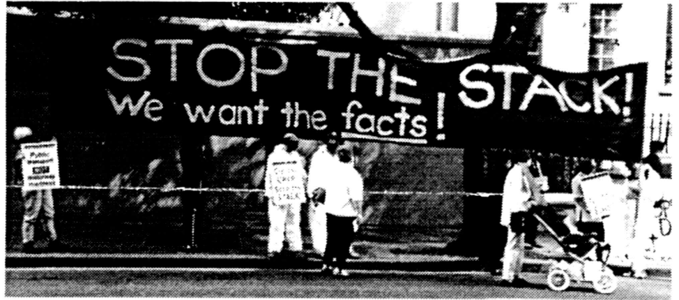
Members of the WCPS and local group Residents Against Polluting Stacks (RAPS) demonstrating outside NSW Parliament last year.

of around 60,000 vehicles a day from the tunnel. (That's around 21 million vehicles a year).