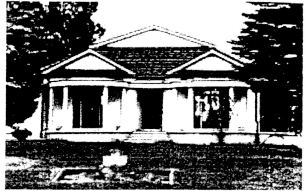
Tempe House, built in 1836, was designed by the celebrated colonial architect John Verge

• Write to Premier Bob Carr protesting against the Interciti proposal. Tell him that Tempe House's environs and Cooks River foreshores should be protected from high-rise development. Address to: Parliament House, Macquarie Street NSW 2000.