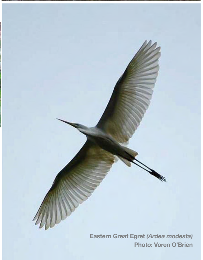
Eastern Great Egret ( Ardea modesta )

We've all heard the Channel-billed Cuckoos screeching over the summer. Voren O'Brien caught this one on camera near the Adora Chocolate Shop. She also caught some great shots of a Great Egret at Turrella Reserve.