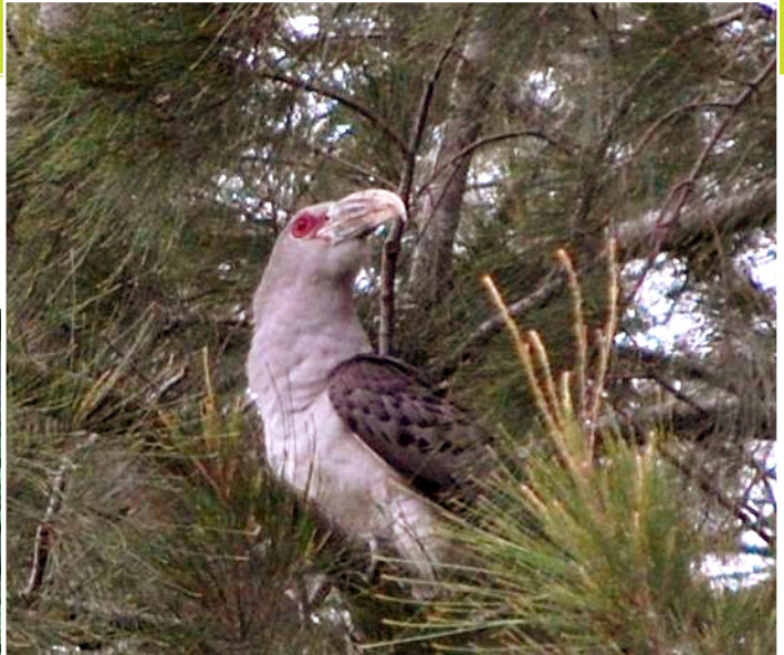
Channel-billed Cuckoo ( Scythrops novaehollandiae )