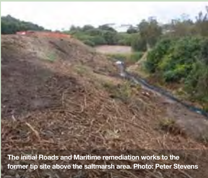
The initial Roads and Maritime remediation works to the former tip site above the saltmarsh area.

Restoration work on the natural saltmarsh area below Jackson Place, Undercliffe is temporarily held up by extensive remedial works being carried out by Roads and Maritime Services to the former illegal tip site above the area (shown left).