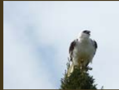
Black Shouldered Kite, seen in Jackson Place this month.

There is a petition to sign and the Society has produced a postcard you can send to the Premier.