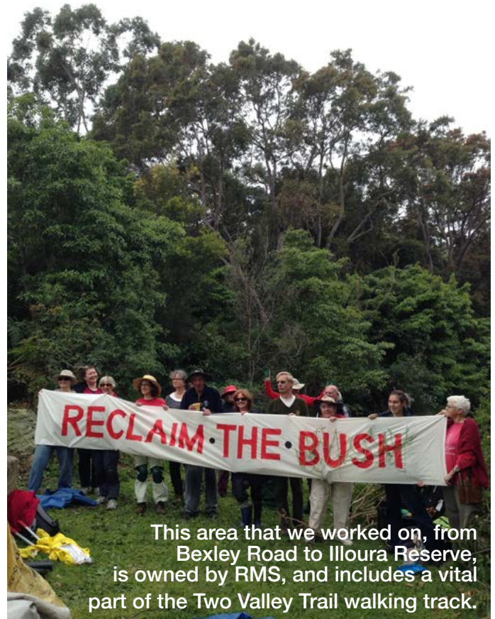
This area that we worked on, from Bexley Road to Illoura Reserve, is owned by RMS, and includes a vital part of the Two Valley Trail walking track.