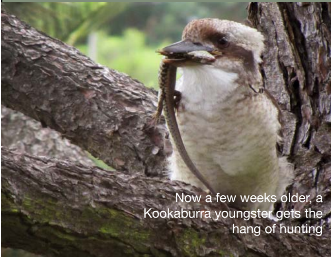
Now a few weeks older, a Kookaburra youngster gets the hang of hunting

On one of our bird surveys last year, we also saw that the pair of Kookaburras near Girrahween Park were feeding one fledgling, so that's good news too.