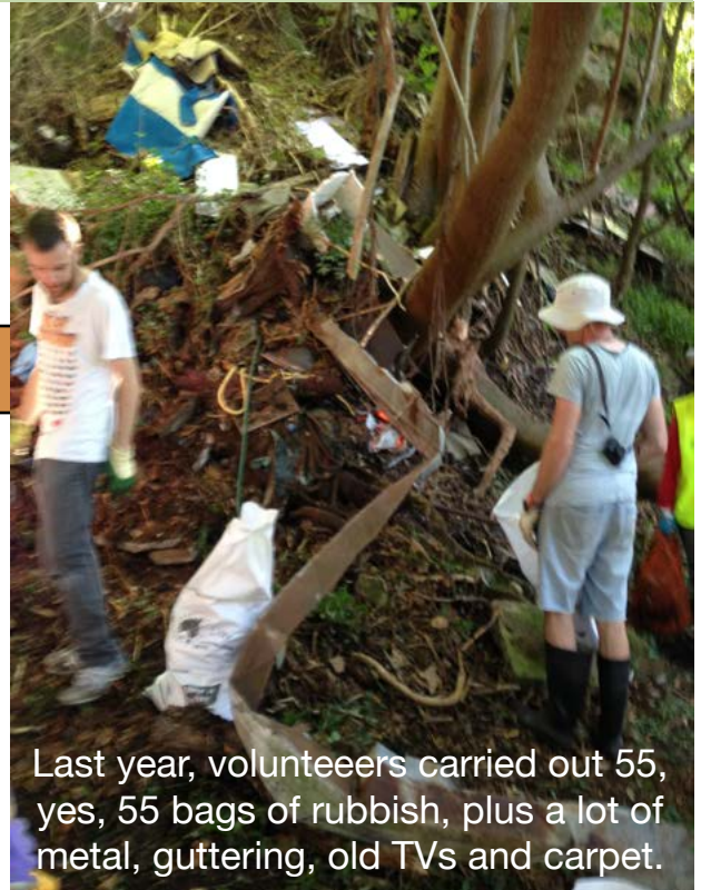
Last year, volunteers carried out 55, yes, 55 bags of rubbish, plus a lot of metal, guttering, old TVs and carpet.

Facebook https://www.facebook.com/events/1679053312334133/