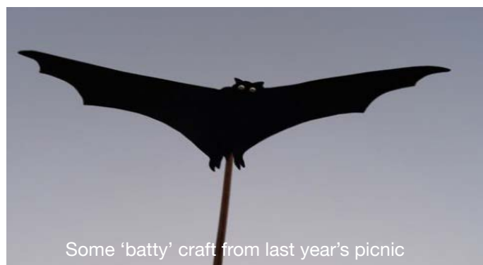
Some 'batty' craft from last year's picnic

These animals are a protected species, because they are vital to the spread of native plant pollen, yet their habitat is steadily being eroded.