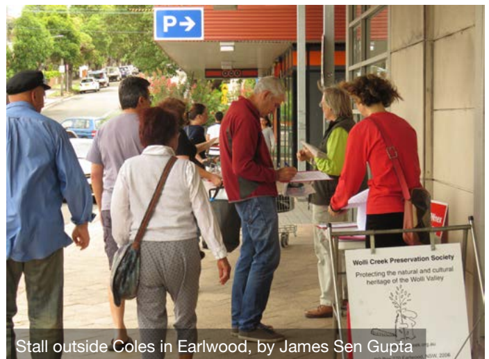
Stall outside Coles in Earlwood

There were also many other individuals and groups campaigning against the WestConnex EIS and we have been advised that over 9,000 objections have been submitted to the Department.