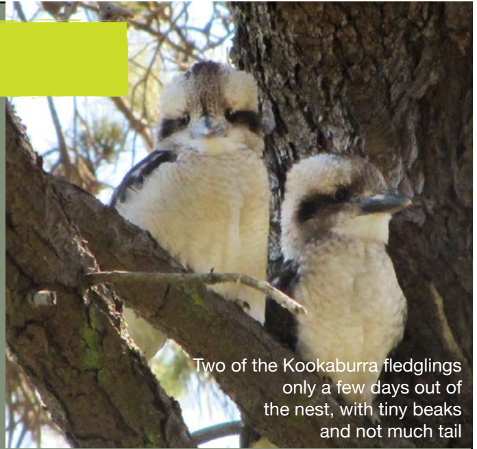
Two of the Kookaburra fledglings only a few days out of the nest, with tiny beaks and not much tail

All three are still alive, doing well and making a lot of noise.