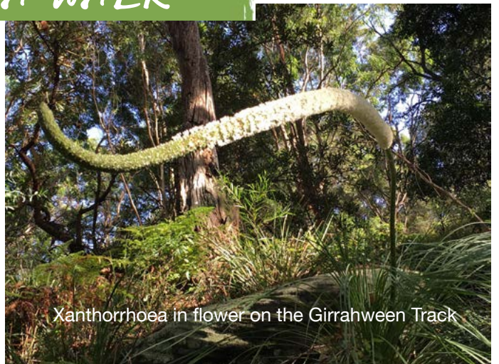
Xanthorrhoea in flower on the Girrahween Track