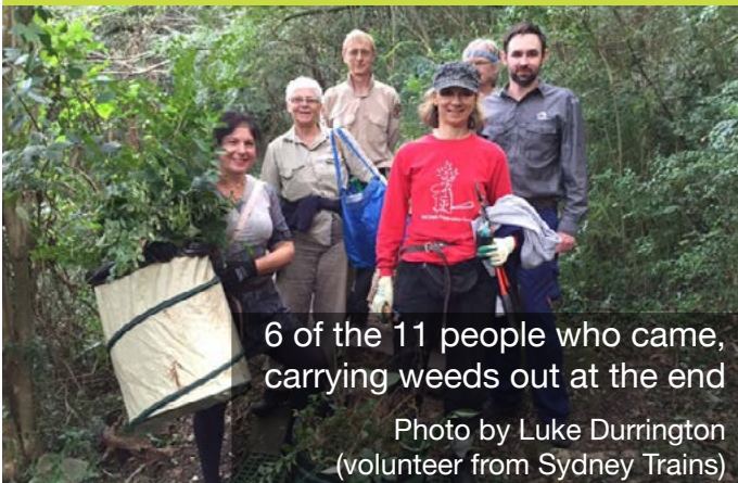
6 of the 11 people who came, carrying weeds out at the end

People have reported that the well-fed FF's returned to the camp in the last week of May