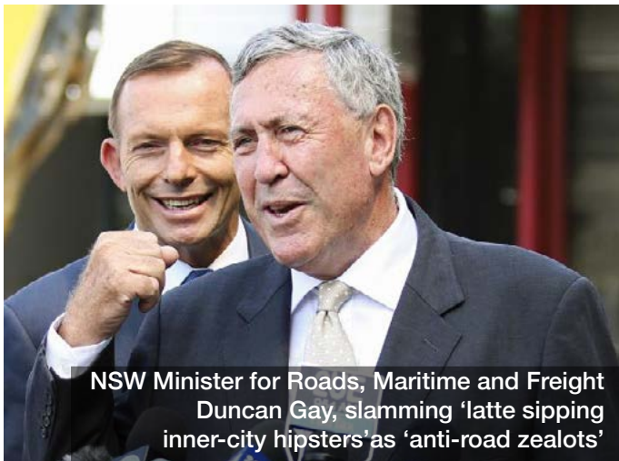
NSW Minister for Roads, Maritime and Freight Duncan Gay, slamming 'latte sipping inner-city hipsters' as 'anti-road zealots'