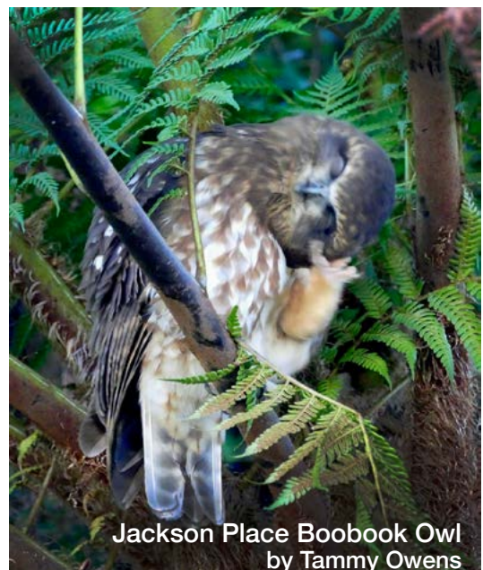
Jackson Place Boobook Owl

Wolli Walk: Sunday 19 June from 8.30 am. Starting at Bexley North and going through the Valley, with environmental and historical commentary focusing on the various battles fought there. To register contact info@wollicreek.org.au