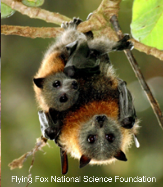
Flying Fox National Science Foundation