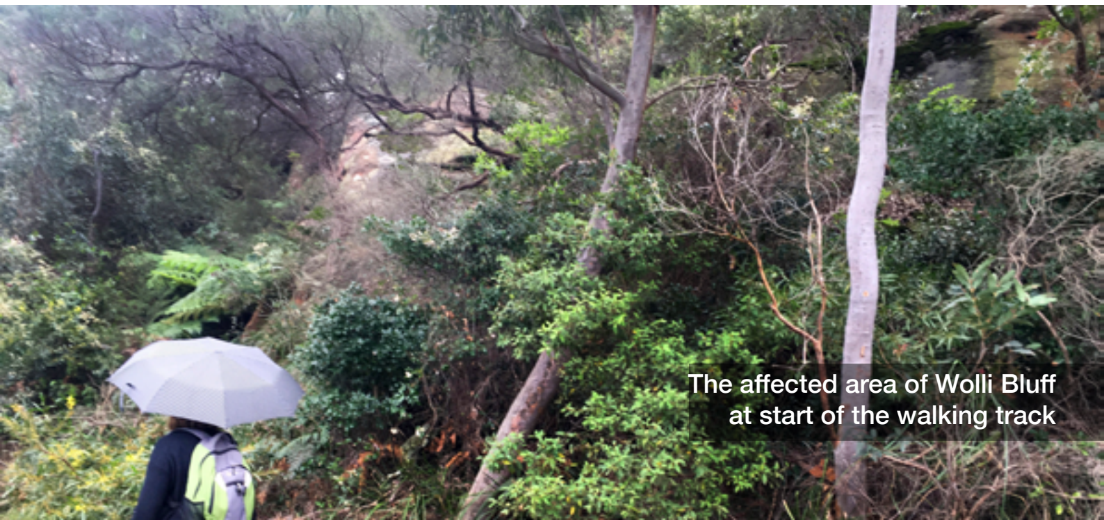
The affected area of Wolli Bluff at start of the walking track

"This is only the second time I'm doing bushcare at this site. The great thing about bushcare is you get time to slow down and really appreciate how beautiful the bush in the Valley is. Especially at this end of the Valley, the rocky outcrops are fantastic! And Wolli Bluff forms such a great eastern entrance to the Regional Park."