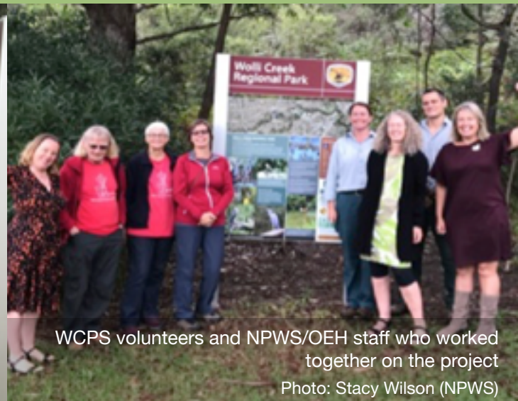
WCPS volunteers and NPWS/OEH staff who worked together on the project

At the end of March, National Parks and Wildlife Service and Office of Environment and Heritage staff organised a thank you morning tea to acknowledge the work of Wolli Creek Preservation Society volunteers who collaborated on the production of a new NPWS interpretive and way-finding panel.