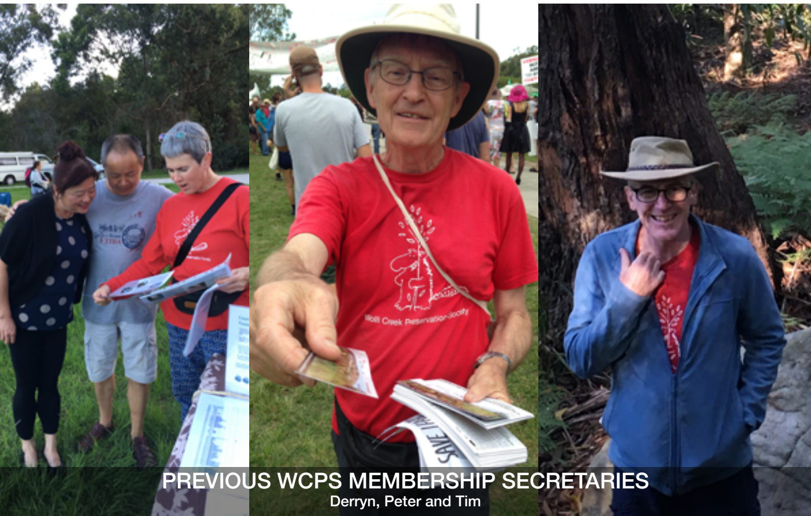
PREVIOUS WCPS MEMBERSHIP SECRETARIES