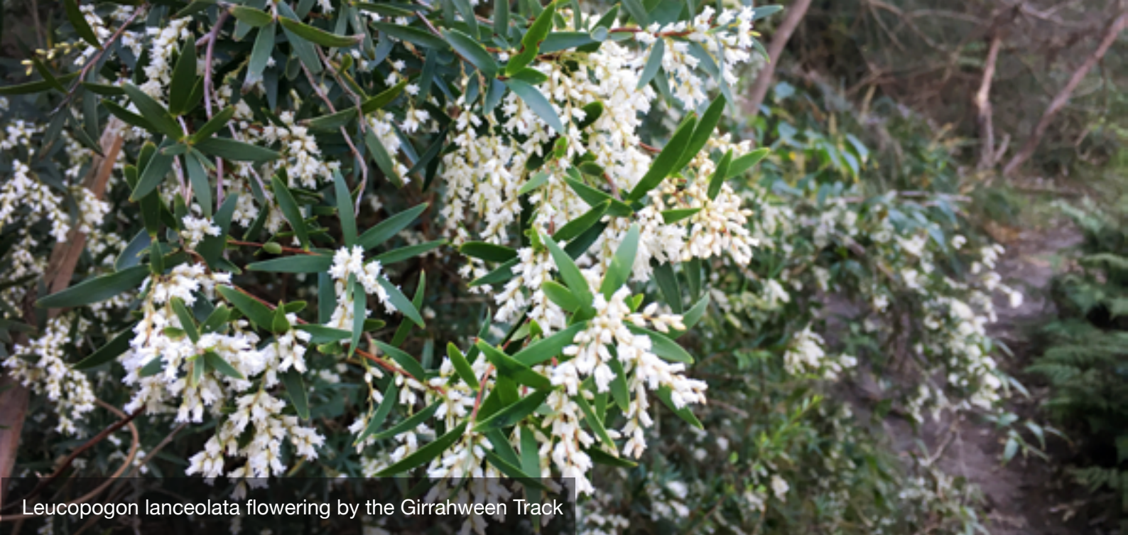
Leucopogon lanceolata flowering by the Girrahween Track