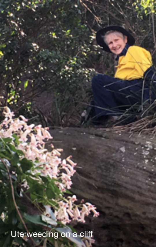
Ute weeding on a cliff