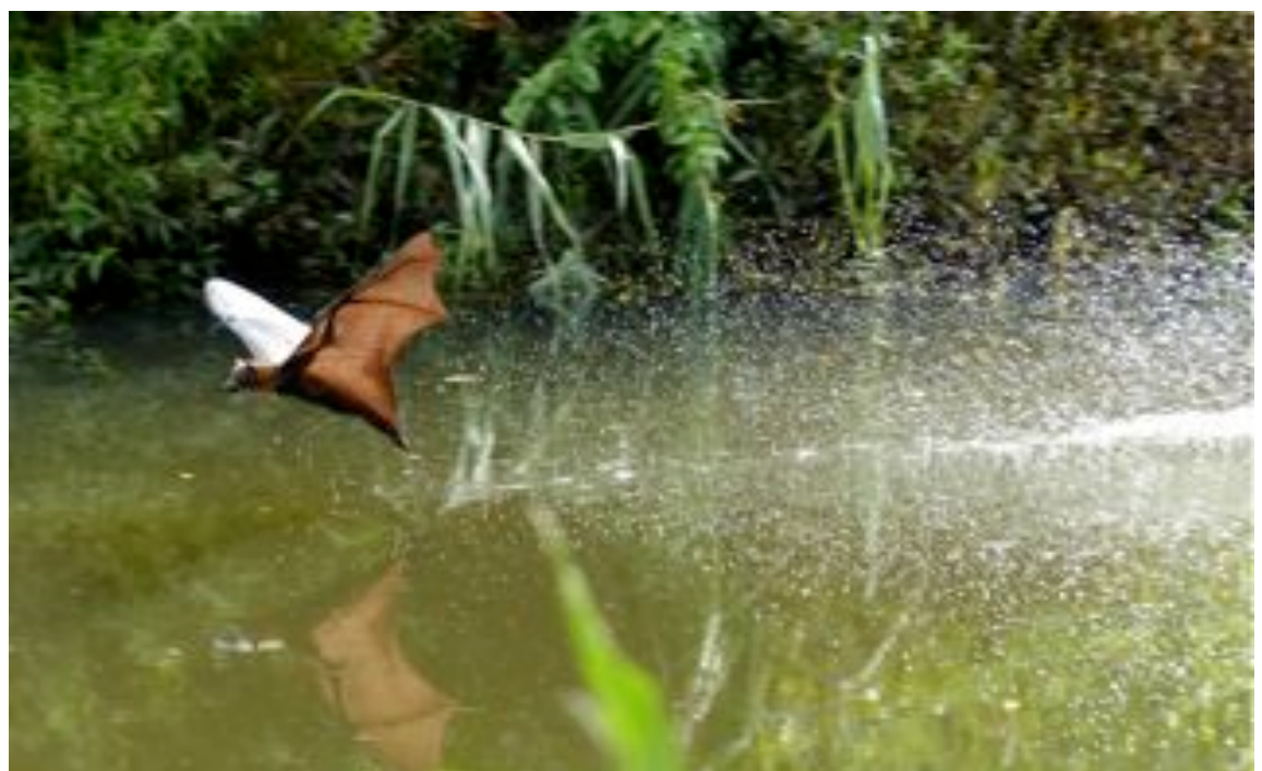
Grey-headed Flying-fox skimming Wolli creek to drink and cool down