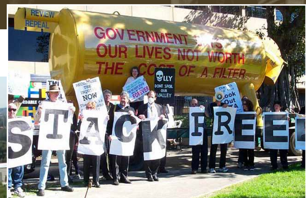
Anti Stack Campaign, by Residents Against Pollution Stacks